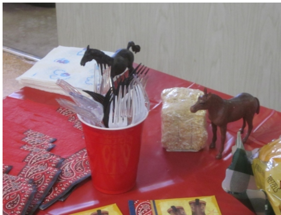
Top left: Herons in many stages Top right: Western fun Left: Table decor Right: Jeanette's creation-a timely frame Below left: Yum! Below right: Man in Kitchen! Bottom left: Quite a spread with matching table decor Bottom right: Hats and smiles