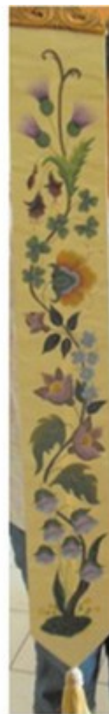
MAY (5th Sat)