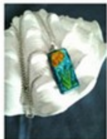
AUGUST (not exact item)