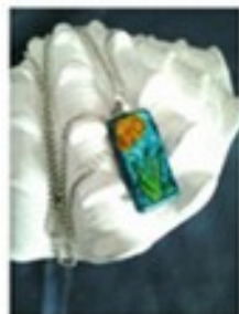
AUGUST (not exact item)