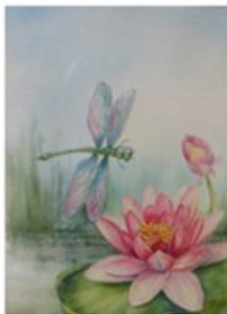
AUGUST (5th Sat)