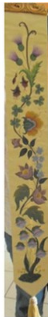
MAY (5th Sat)