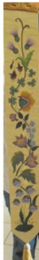
MAY (5th Sat)