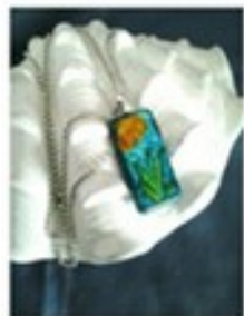
AUGUST (not exact item)